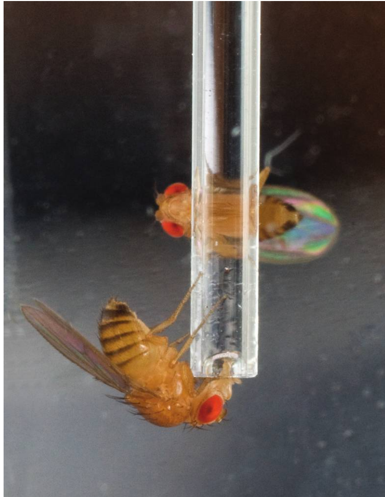
A feeding fruit fly.