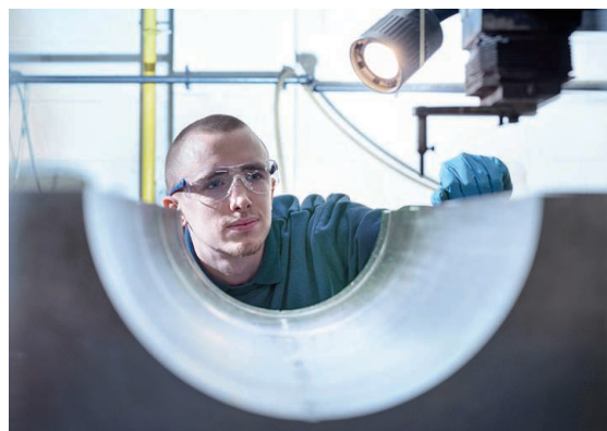
An engineer uses a technique known as electrical discharge machining to drill holes in a metal part.

The reviewer is at the Centre for Biological Diversity, University of St. Andrews, St. Andrews, Fife KY16 9TH, UK. Email: kn11@st-andrews.ac.uk